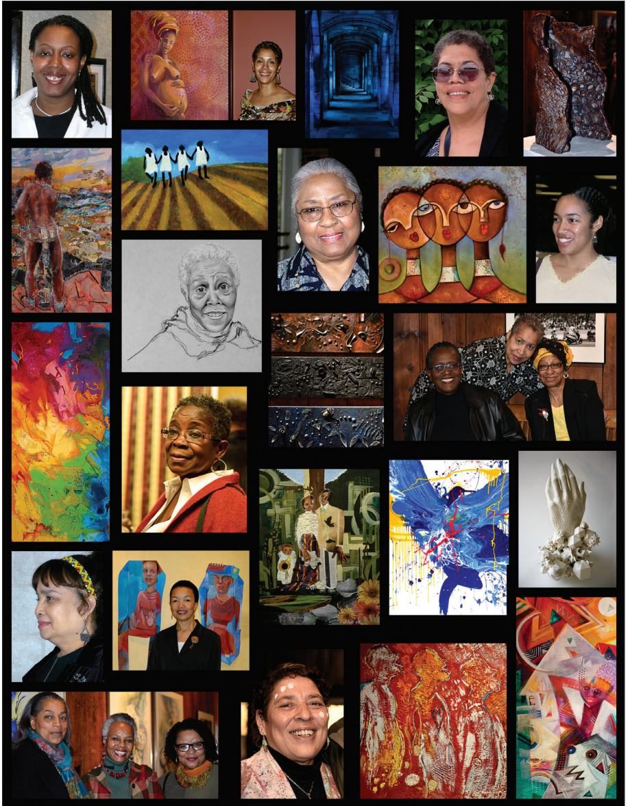
Collage Image of Sapphire & Crystals by Rose Blouin