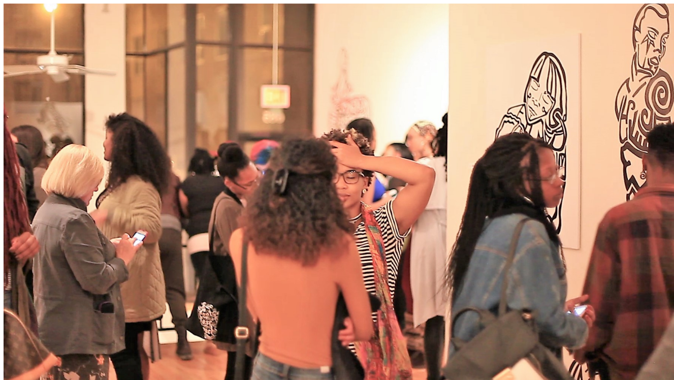
Top image: WMG Halloween Party during Adele Supreme Solo Show, October 2016 Bottom: Students from After School Matters visiting Wild Cuts Group Exhibition 2017