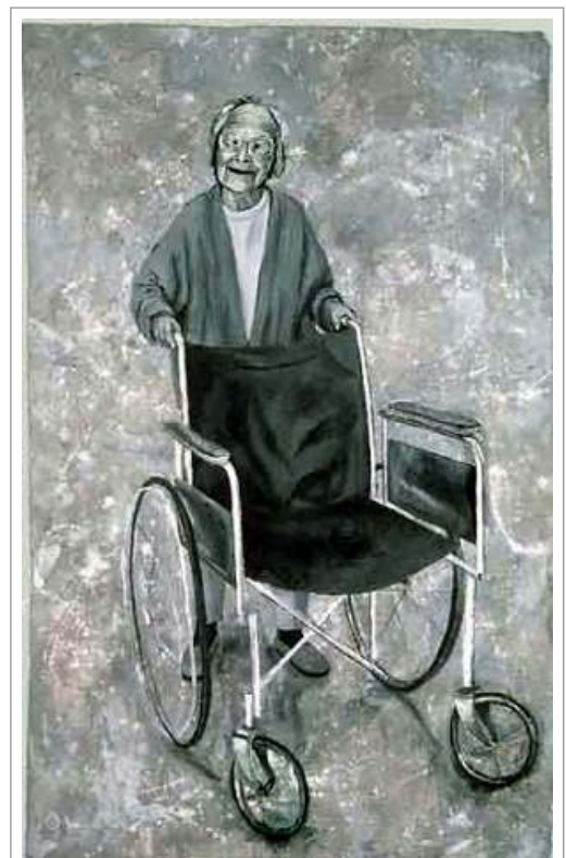
'Loi, 99 Years Old' by Joanna Katz acrylic on unstretched canvas 68 x 42 inches

"The art in 'Signatures of Age' addresses body changes, beauty obsessions, health issues, societal ills, individual identity, emergence, survival, transformation and just being here. The pieces included, like aging itself, range from poetic to disturbing, humorous to pensive and defiant to enduring.