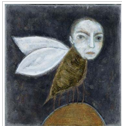
'Joe as the Bee Boy' by Pamela Callahan oil on wood, 10 x 9"

The exhibition opens on September 1 st with an artist reception from 6 to 9 pm at Woman Made Gallery, 685 N. Milwaukee Avenue in Chicago's River West neighborhood.