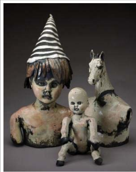
'Mixed Family Portrait' by Rhonda Gushee Raku. 21" H

Mainly, I attempted to give the unseeable animal---call it intuition, imagination, subconscious, maybe even soul---center stage. For it's what pulls us, weights us, propels us and guides us---if we let it."